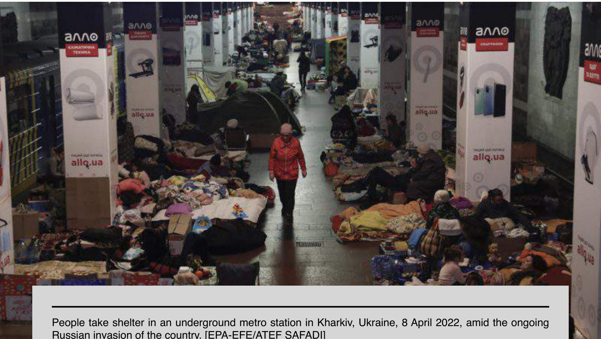
People take shelter in an underground metro station in Kharkiv, Ukraine, 8 April 2022, amid the ongoing Russian invasion of the country.